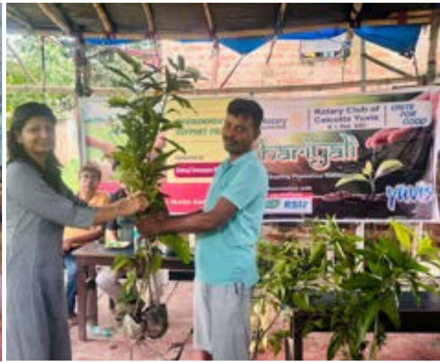
500 Plant Saplings to 125 Families Sonarpur_27.07.2025