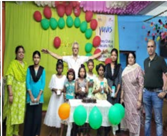
Zindagi - Birthday Celebration of 7 Girls of CMS, Hindmotor_27.07.2025