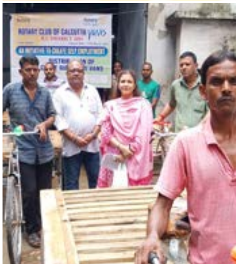
Swanirbhar - 5 Rickshaw Van Distribution to Local Vegetable & Fruit Vendors at Belur_29.07.2025