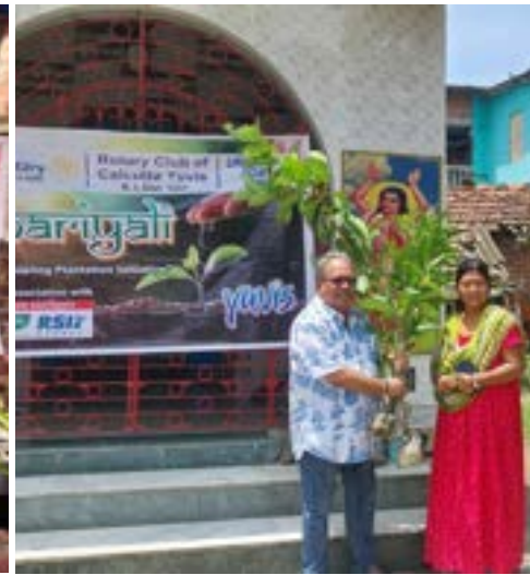
500 Plant Saplings to 125 Families Baruipur_27.07.2025