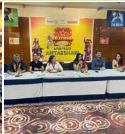
Joint Meeting of 4 Clubs at Haldiram banquets_03.08.2025