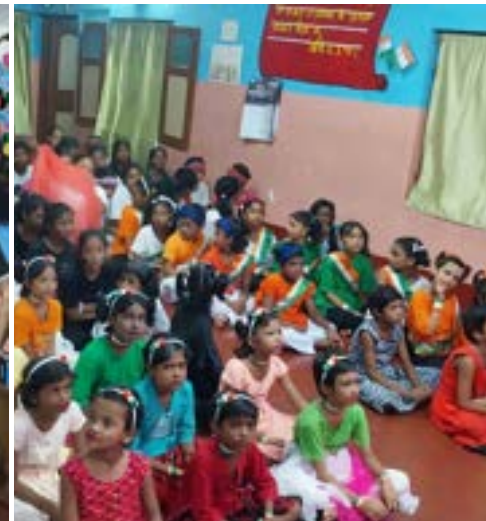
Independence Day Celebration at CMS, Hindmotor_15.08.2025