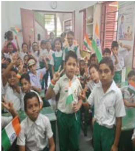
Independence Day celebration at Green Leaves School_15.08.2025