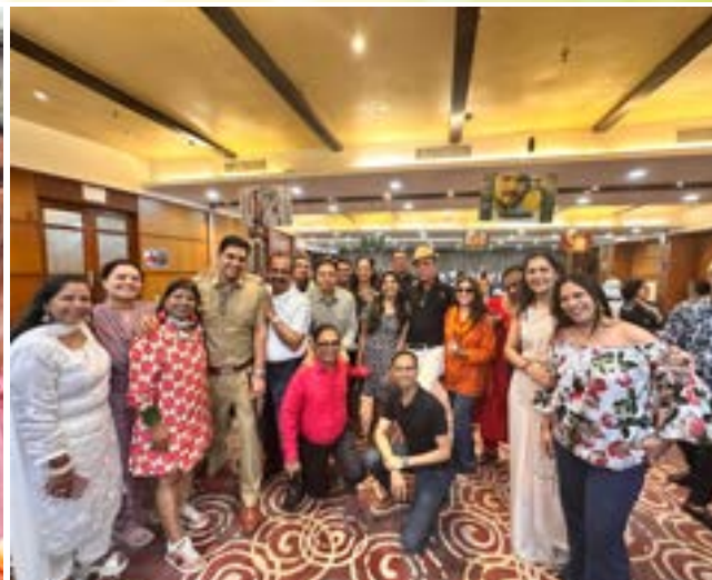
Bollywood Theme Based Antakshari of 4 Clubs at Haldiram Banquets_03.08.2025