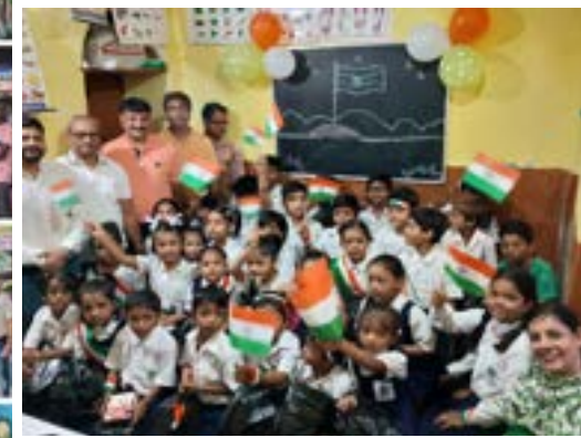
Independence Day Celebration at Ganesh Shankar Vidyalaya_15.08.2025