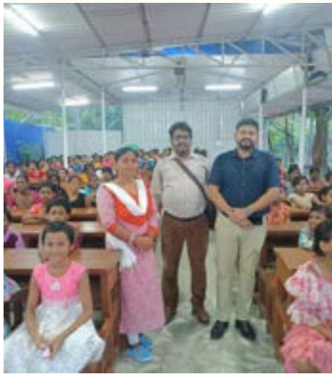
Visit to SPCI Home, Joka for Girls_14.08.2025